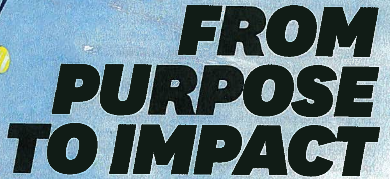
Figure out your passion and put it to work. BY NICK CRAIG AND SCOTT SNOOK