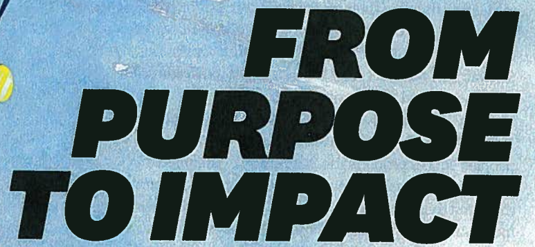
Figure out your passion and put it to work. BY NICK CRAIG AND SCOTT SNOOK